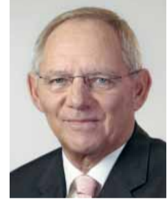
Dr Wolfgang Schäuble

The Federal Minister of Finance , Dr Wolfgang Schäuble, directs the Ministry in line with the policy framework defined by the Federal Chancellor. He is the member of Government responsible for all aspects of Germany's fiscal and tax policy.